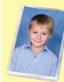
Magnet Image size 4.5 x 6.5cm