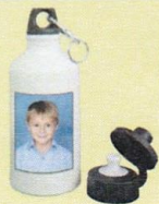
Drink Bottle 500ml

The products below may only be ordered with the purchase of one or more of the above options