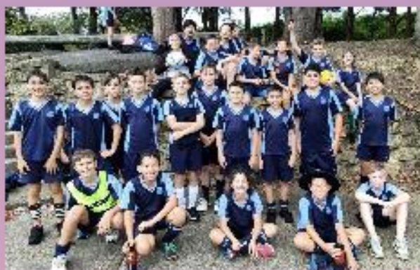
The Gala Day soccer teams.

What a week in sport! Year 2 also enjoyed the ball games carnival on the astroturf as they competed in numerous relays, ball passing and cheering each other on. It's so great that we can get outside and play sport with one another while enjoying the beautiful sunshine.